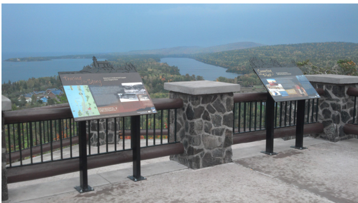
Copper Harbor overlook and interpretive signs, Brockway Mountain Drive.

Learn more about the Copper Country Trail and the adventures it has to offer you at www.coppercountrytrail.org .